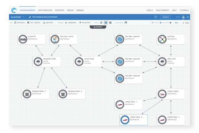
Web-Based catalog and one-touch deployment