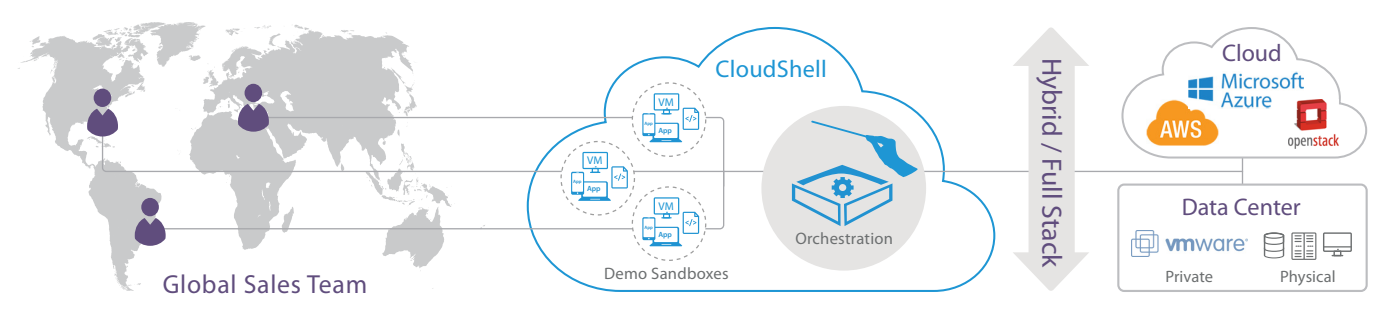
Quali gives global sales teams on-demand access to full stack, hybrid cloud demo environments

Quali's innovative approach is the only true full-stack and hybrid cloud solution, allowing your sales teams to create, manage, deploy, and reclaim demo sandboxes that run in the cloud, in your private data-center, or both. Quali even allows you to configure and manage access to physical devices, test equipment, and network gear. This means your sales teams can deliver rich, complex, enterprise grade demos that perfectly match your customer scenarios and can scale to meet sales demand, without unnecessary costs.